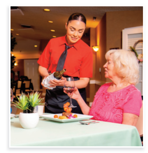
Skyview Dining Room

The Village offers meal plans that allow you to dine as you choose. On a monthly basis, you can choose meal plans for 7, 14, 21, or 30 meals per month or just go à la carte and pay as you dine. Whichever choice you make, our Chef provides an ever changing menu that is sure to please. Of course, you can always choose to enjoy a meal out at area restaurants or dine-in on takeout or a home cooked meal from your own recipe book – the choice is yours!